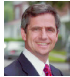
Admiral Joseph Sestak

The Delaware County Press Club is proud to host the first 7th Congressional District Candidates Debate, Friday, Oct. 6, at the Drexelbrook Corporate Events Center. Republican incumbent Congressman Curt Weldon and Democratic challenger, Joseph Sestak will participate in a presidential-style debate format.