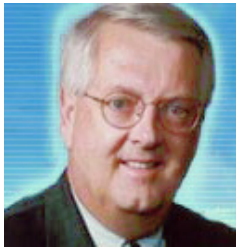
Congressman Curt Weldon